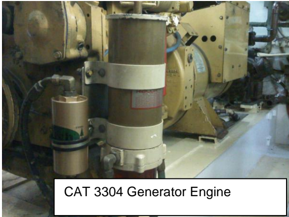
CAT 3304 Generator Engine